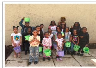
The most popular events at the Carina were the after-school events for children (avg. attendance = 11 children). The adult events had little to no attendance.