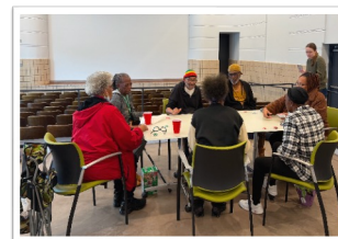
The most popular events at the Letsche were the entertainment events. There was a consistent group of older adults who came to our events (avg. attendance = 5).